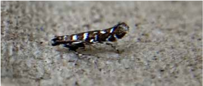
CLOVER SLENDER (TH)

14.009 Lime Bent-wing Bucculatrix thoracella 2006: Capel Road: 27 July (PF) 2013: Capel Road: 11 June (PF)