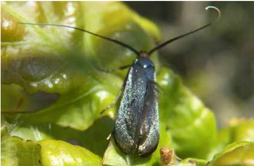
GREEN LONGHORN (TH)

7.009 Little Longhorn Cauchas fibulella 2011: Windsor Rd: 20 April (JL)