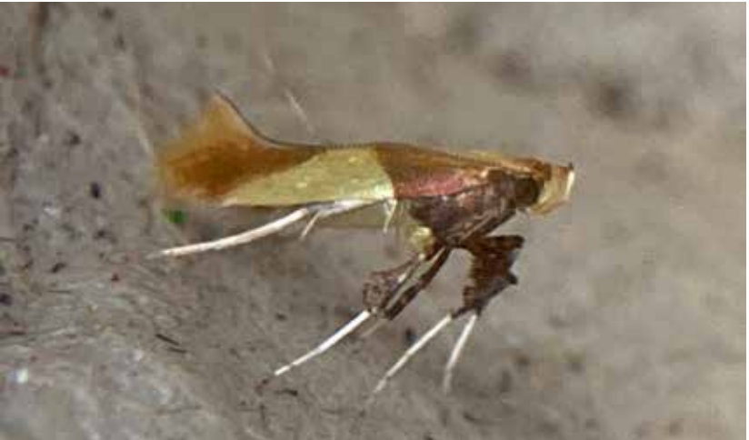
YELLOW-TRIANGLE SLENDER/NEW OAK SLENDER (TH)

15.007 Azalea Leaf-miner Caloptilia azaleella 2020: LH: 8 May